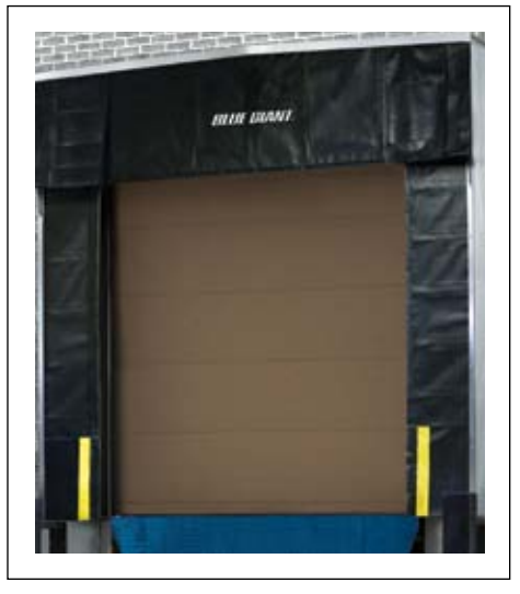
BGDSHS Stationary Dock Shelter