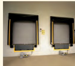
Rolling Service Doors