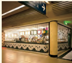
Rolling & Side Folding Security Grilles & Closures