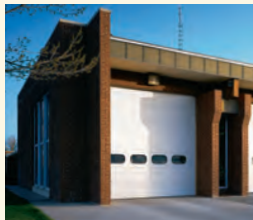
Thermacore® Sectional Doors