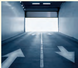
Advanced Rolling Steel Door RapidSlat®