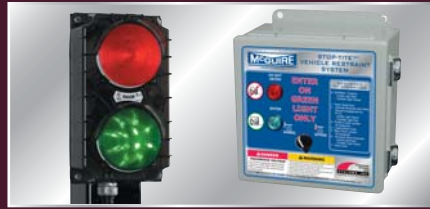
Optional light package and control panel with instructional decal for additional communication safety.