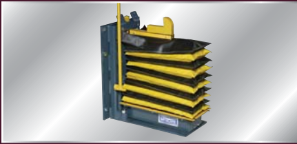
STOP-TITE® manually operated unit can be set and released easily from the dock with included operate handle.