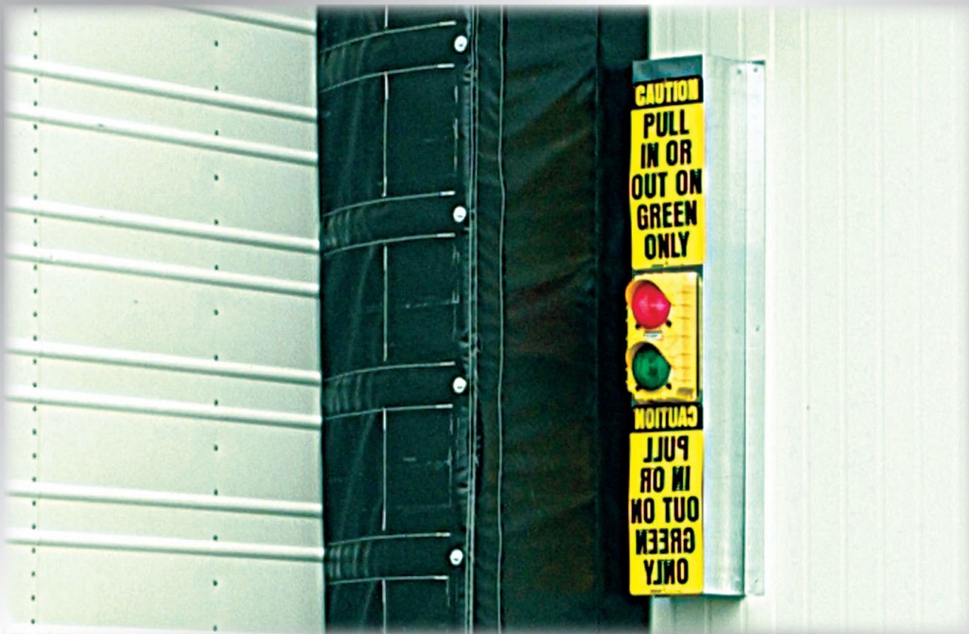
* Shown are lights and signs next to truck at dock