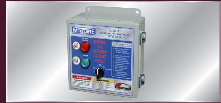
Light Communication System Control panel for automatic lights - manual light control panel similar.

The Light Communication Systems is a simple, reliable, and cost effective warning system that establishes a clear line of communication between truck drivers and dock personnel, thereby reducing the risk of accidents at the loading dock.