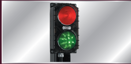
Exterior Lights - incandescent standard with optional LED for longer life.