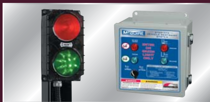
Optional LED light package and standard push button control panel with instructional decal for additional communication safety.