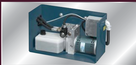
STOP-TITE® self contained motor/pump can be remote mounted.