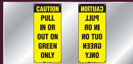
A set of standard and mirrored image caution signs warns truck driver to "Pull in Or Out On Green Only".